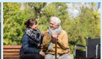
Holiday & Event Care