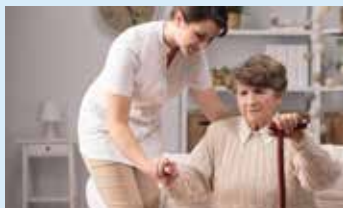
Brain Injury Care