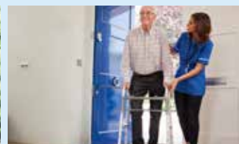
Hospital to Home