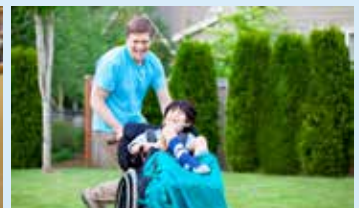
Spinal Injury Care